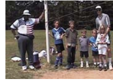
Soccer Shoot out

Being a Knight provided opportunities to get together as families. Our council has sponsored a pool party, bowling day, a Christmas social, a basketball free throw contest ,and a soccer shootout. . Our Youth Ministry also sponsored a trip to the John Paul II Center for the Acolytes of St. Andrew's.