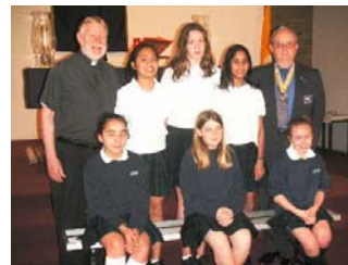
Pro-life Poster contest

The Knights are active in the Pro-Life movement. Last year members of our Council attended the March for Life in Washington and the Kick-off Rally held before the March. The Foundation and ceremonies of our Order emphasize Catholic values and renewed pride in our membership about being Catholic in a world that increasingly is secular. It is significant that we begin and end our meetings in prayer. We pray for the unborn.